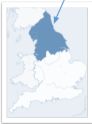
North of England